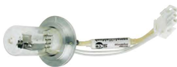
Agilent 1100 DAD 27-32-02845