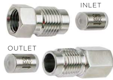
OPTI-MAX for L-7100