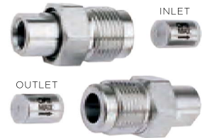
OPTI-MAX for 880/980 Series