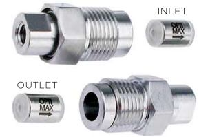
OPTI-MAX for BIP 1

OPTIONS: Stainless steel/ceramic OPTI-MAX Cartridges are listed above. For other options, please see page 50.